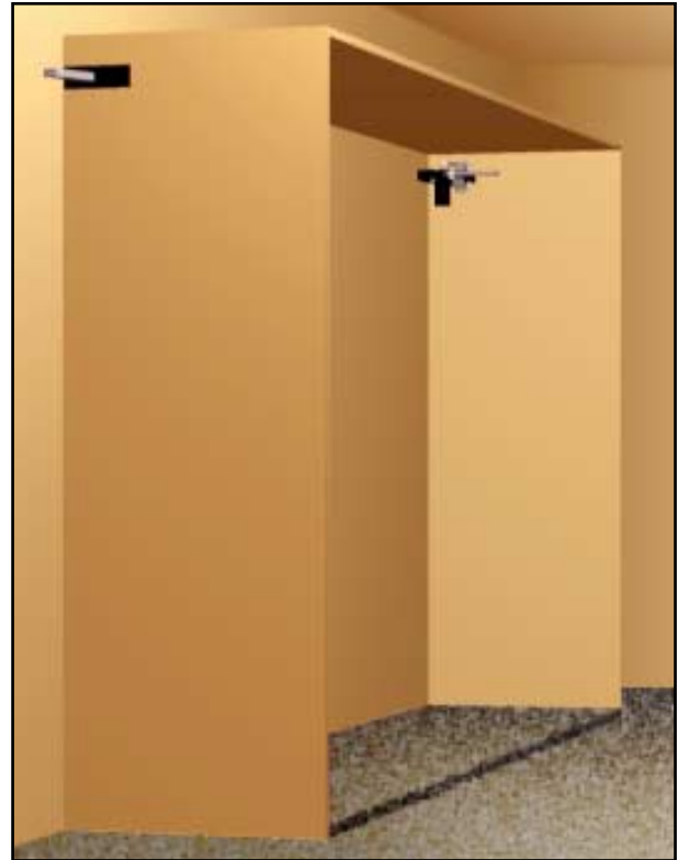
The Travel Clamps are located inside the room, at both top corners.