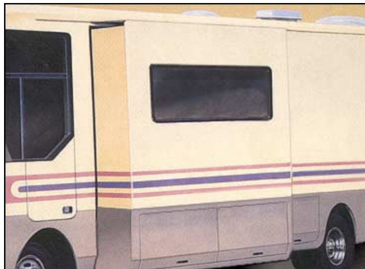
Exterior of room and coach.